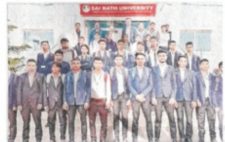
कैडेट्स सेनेगुप्तान में शामिल विद्यार्थी