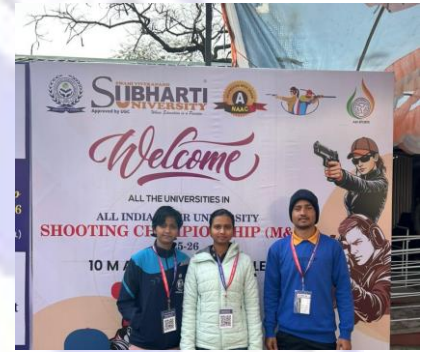
Students participated in the National Level Shooting competition.