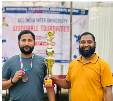
Students of B.P.Ed. department won 'The Woodball Tournament'.