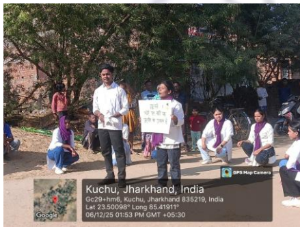
Students of FHSS performing 'Nukad Natak' in nearby village.