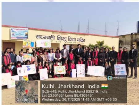
Students of FLSR spreading awareness about Child Trafficking.