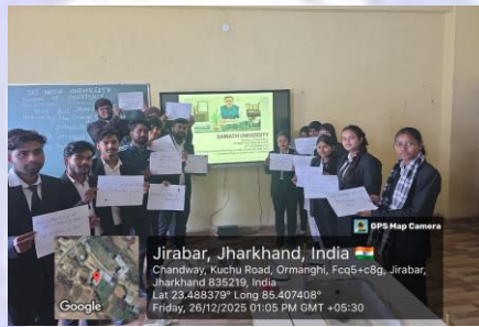
Students of SOP Celebrating "Veer Bal Diwas".